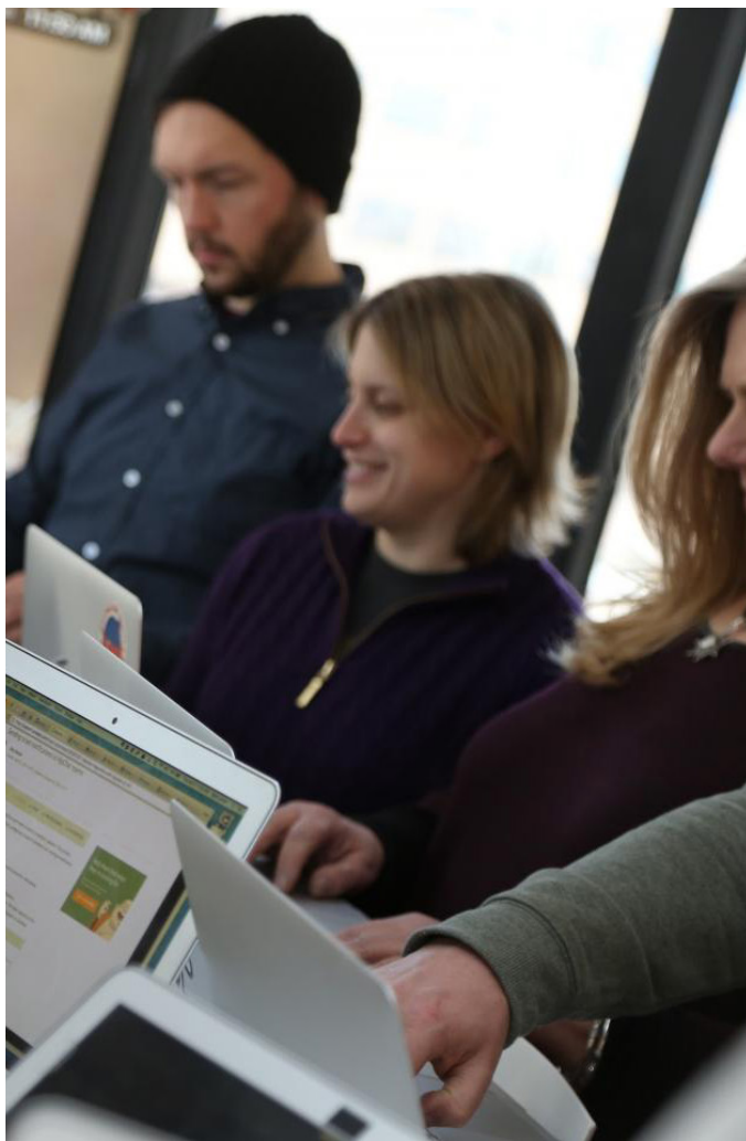
Sage Intacct's revenue recognition solution allows Acquia to keep complex, multi-subscription contracts centralized.