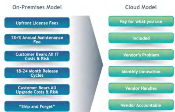
Figure 1. Cloud computing turns Capex into Opex

5. ROI/TCO. Although the financial models can vary significantly, the total cost of ownership is typically far lower for cloud-computing systems than it is for on-premises and hosted systems. Take the time to carefully structure proper ROI scenarios and timelines to determine the investments and payback periods. The only ongoing costs should be monthly fees for the software subscription, training, and configuration. If you are comparing cloud to on-premises, remember that software licensing for an on-premises solution actually makes up a very small percentage of its total cost. Additional ongoing costs may include customisation, hardware, IT personnel, maintenance, training, tuning, customisations, network maintenance, and much more. And that translates into a far more difficult investment hurdle. What's more, cloud computing costs are taken entirely from OPEX, whereas on-premises deployments typically include even larger OPEX plus significant CAPEX investments. (See Figure 1.)